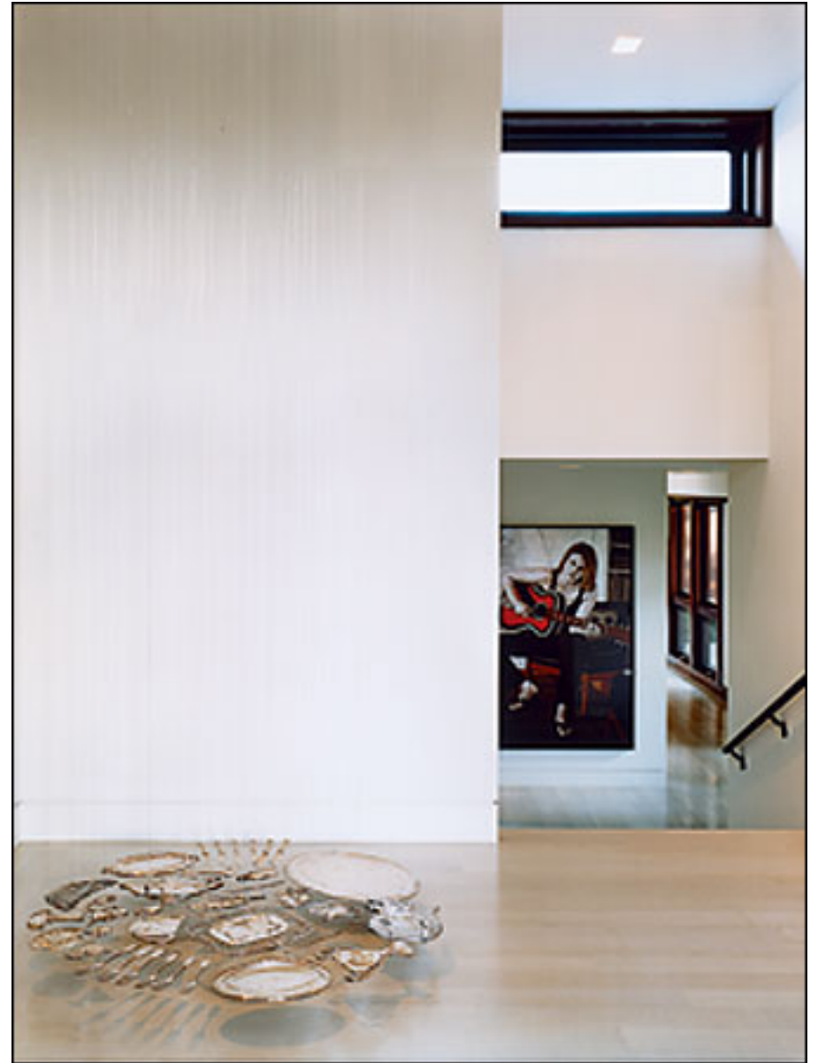
Architect: Deborah Berke, NY